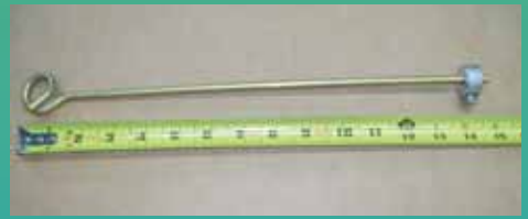
1/4" dia. brass rod 15" long w/lock collar.

Pan Floats offer easy water level adjustment. Heavy gauge aluminum with welded seams. Available with 3/8" or 7/8" center tubes for rods or chain.